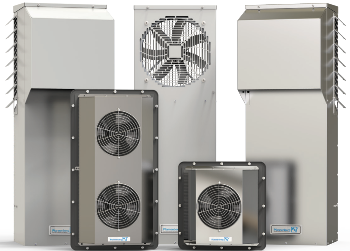
PKS Air/Air Heat Exchangers